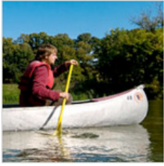
Nebraska, With a Paddle