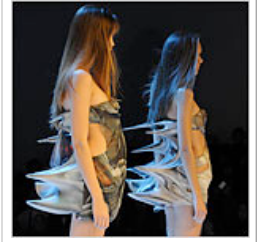
Review: Recharging the City of Light

Home | World | U.S. | N.Y. / Region | Business | Technology | Science | Health | Sports | Opinion | Arts | Style | Travel | Jobs | Real Estate | Automobiles | Back to Top