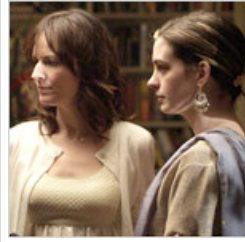
Out of Rehab, Wreaking Havoc