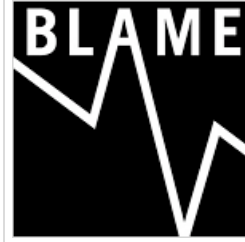
Letters: The Wild Ride of the Bailout Plan