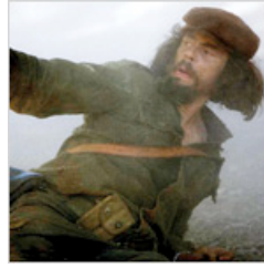
Revolutionary Hero, Relentless Heroine

In New Orleans, evacuations and closings have become a necessary part of restarting the education system.